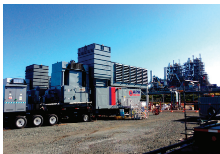
Confidential Customer, South Pacific