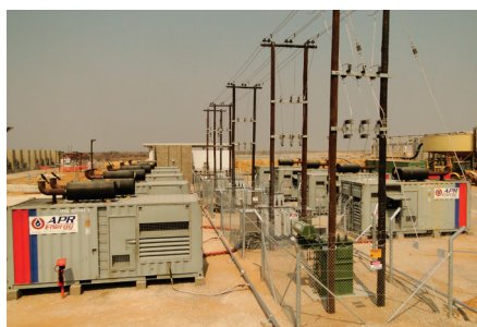
Discovery Metals Ltd., Botswana

APR Energy provided global mining giant Vale with a reliable source of backup power for the construction phase of its operation in the province of Tete, Mozambique. The solution, featuring diesel power modules, was rapidly delivered, leading to a seamless, uninterrupted supply of power to cover peak demand.