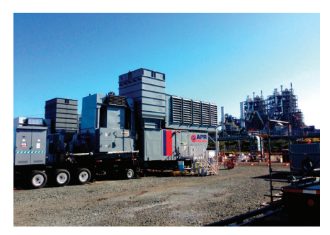
Confidential Customer, South Pacific