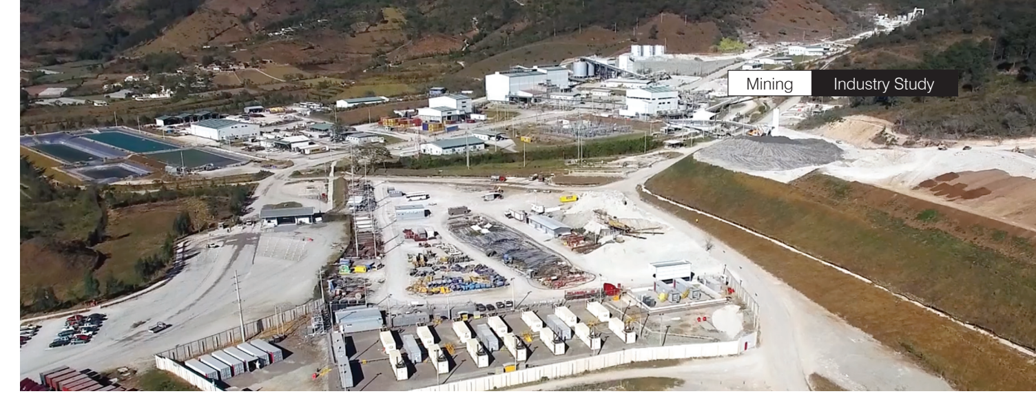
Minera San Rafael, S.A., Guatemala